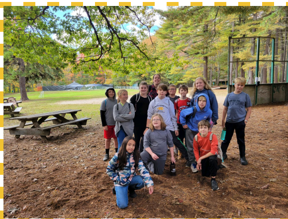
6th Grade Environmental Camp

So thank you parents for helping your child foster independence and GROW!