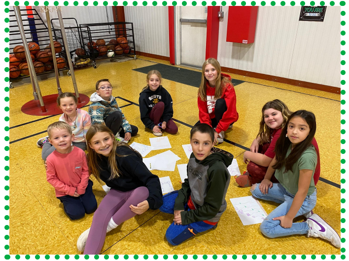
Buddy Group Work-We Can Do Hard Things!